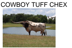
COWBOY TUFF CHEX